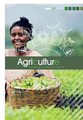
Hans Herren is the author of the chapter on agriculture in UNEP's Green Economy Report.

Herren: Smallholder farmers need to be better supported with information, market access and also land rights, so that they can move on from their present subsistence, smallholder condition to viable units. In some areas of the world we do need more farmers, in others some farmers will need to move on to sell and repair farm machinery, to become food processors, etc. There is not one recipe for all situations. But the one element that will make a change possible and sustainable is to change the price structure of food. The constant push on food prices to accommodate the poor is wrong-headed. We need to eliminate poverty instead and deal with the growing inequality. This will allow farmers to move on and up. Realistic food prices include externalized costs, both positive and negative. The present pricing system for food is actually at the root of most problems on farms and in rural areas.